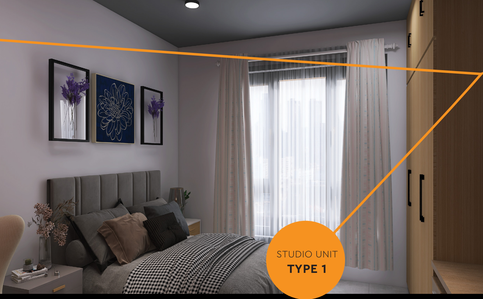
STUDIO UNIT TYPE 1

17 Losai: Where Modern Living Meets Convenience: Nestled in Ngara, 17 Losai offers prime location advantages and modern amenities tailored for young professionals. From sleek studio apartments to rooftop recreation areas, every aspect is designed to enhance the resident experience. For investors, the potential for rental income is lucrative, with rates expected to cater to both long-stay tenants and short-term visitors to the CBD.